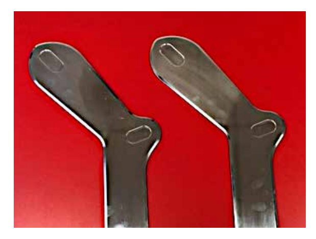
45° foot shape forms